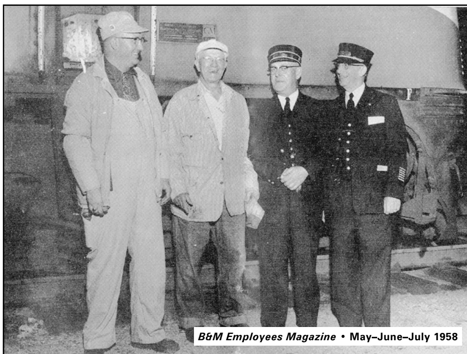
B&M Employees Magazine • May-June-July 1958

Most of the passengers [on my trains] were good—but we always had this joke about Woburn that they seemed to have the prettiest girls and the drunkest guys you ever saw. About 90 percent of the guys who went to Woburn were drunk. We